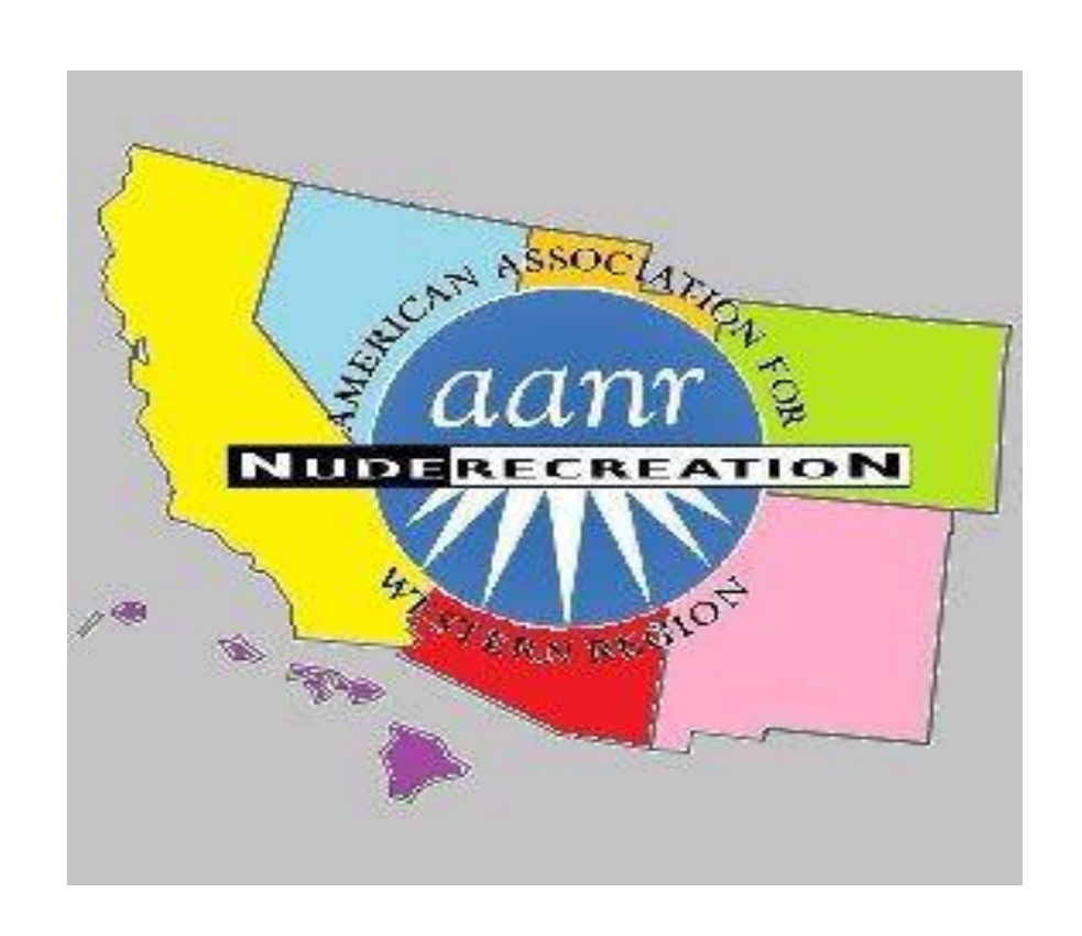
Laguna del Sol March 3