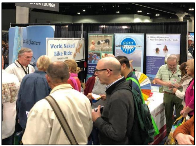
The very busy AANR-West booth at the LA Travel and Adventure Show.