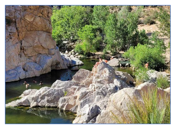
The trek to Deep Creek Hot Springs was enjoyable

All campers and parents wrote on their evaluation forms that they would recommend the camp to other parents, and they all would love to come back next year.