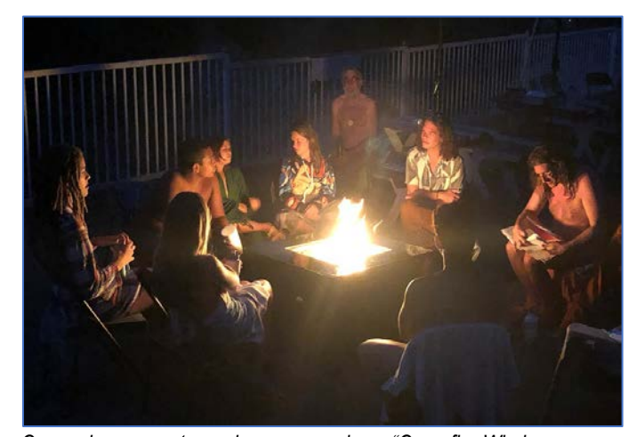
Counselors, parents, and campers enjoy a "Campfire Wisdom Exchange."

Note: Photo releases have been received from the kids and their parents to publish these photos.