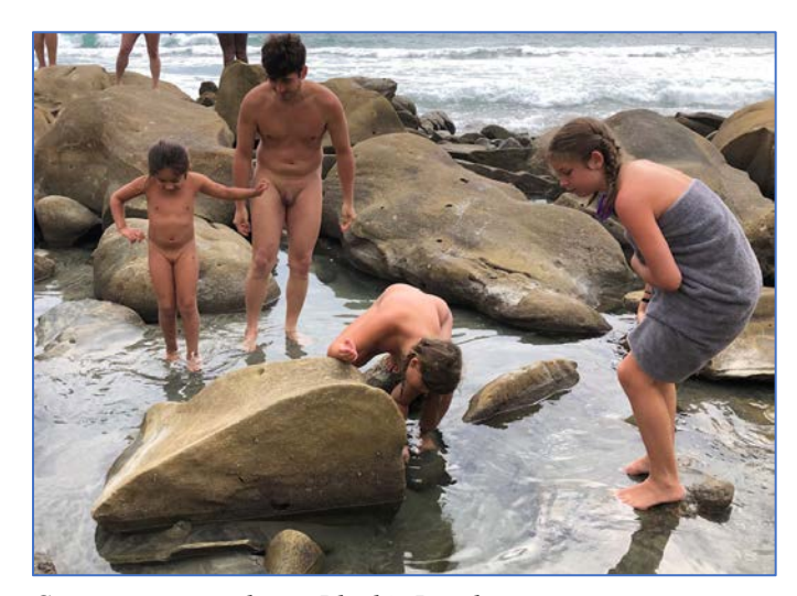
Campers enjoy a day at Black's Beach