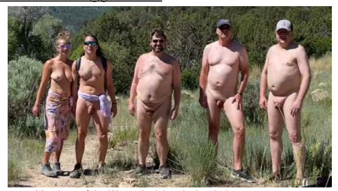
Members of the Wasatch club enjoying their recent campout.

The Wasatch club has developed a popular online blog for stories and comments at: <a href="https://wasatchnaturists.com/blog">https://wasatchnaturists.com/blog</a>. For more information, email the club at: wasatchnaturists@gmail.com.