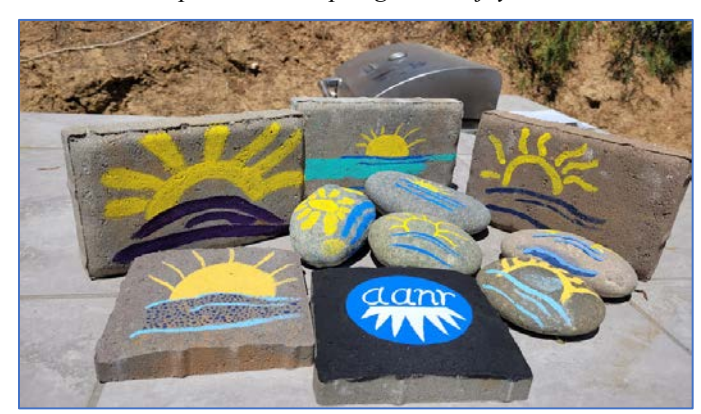
Samples of the Arts & Crafts Day Painted Rock Project