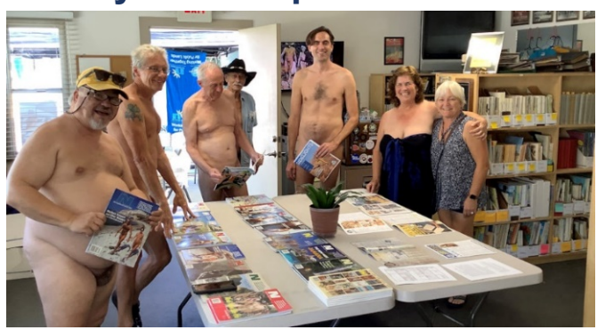
Visitors and Staff Members Enjoy the Library Open House